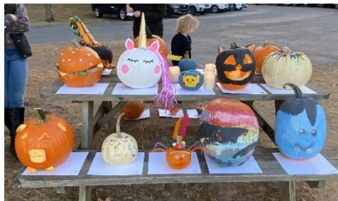
*Photos from October Harvest Festival.