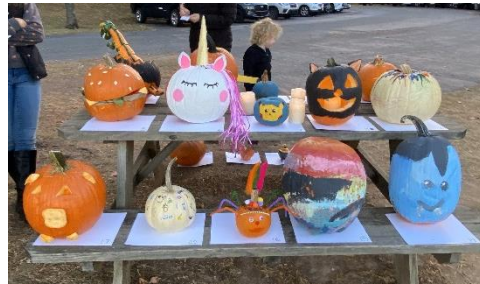
*Photos from October Harvest Festival.