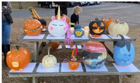
*Photos from October Harvest Festival.